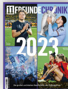
Cover: 11FREUNDE CHRONIK 2023

A real eye-catcher on the pre-Christmas coffee table!